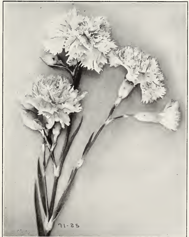
CARNATION—CHABAUD'S GIANT DOUBLE